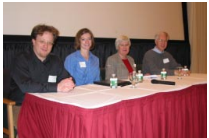
Panelists (left to right)