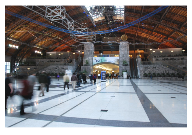
ACRL 2011 Conference entrance at the Philadelphia Convention Center