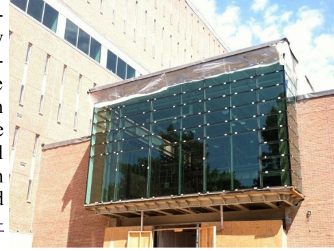
Distance learning classroom

ing, attractive architectural design, and flexible furniture that will provide visitors with the uniquely collaborative space necessary for completing group and individual research. Additionally, the fifth floor will feature many new spaces for faculty, including a faculty collaboration room, nicknamed "collaboratory". This room will be filled with couches, movable tables and chairs, movable whiteboards, a sink, refrigerator and flat panel television. More information can be found on the Renovation Blog and pictures can be found on the Millersville University Library facebook page.